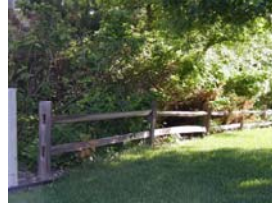
An example of an ornamental fence.